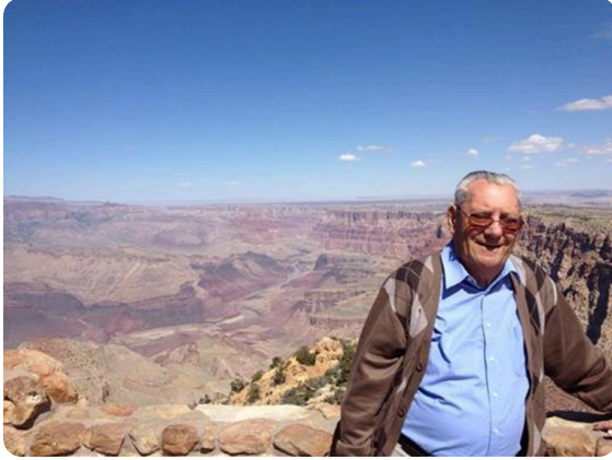
Popsie at the Grand Canyon