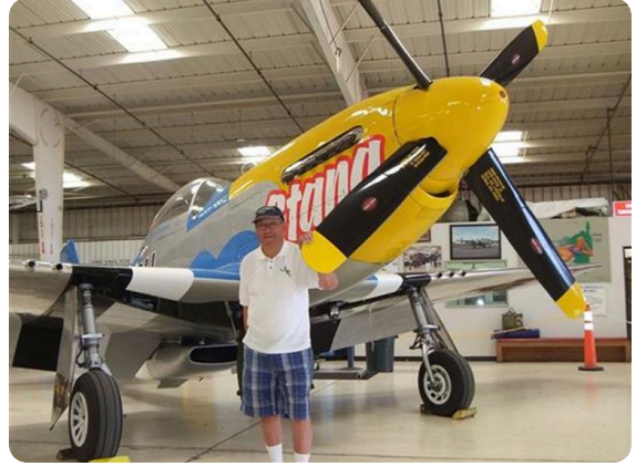
Popsie at the Air Museum